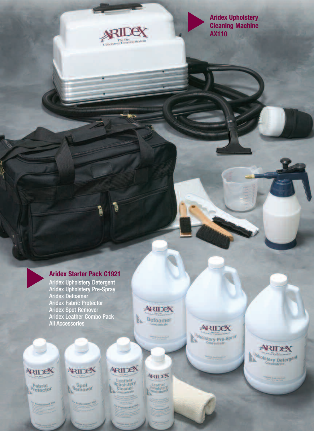
▶ Aridex Upholstery Cleaning Machine AX110